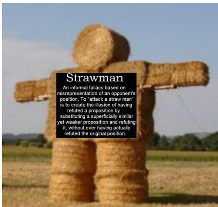
Figure 3Stawman -- will use it to respond on FB