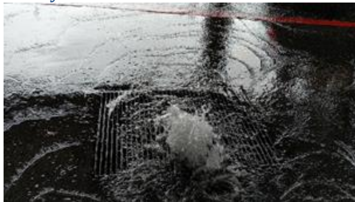
Figure 1A CES sewer spouts beauty