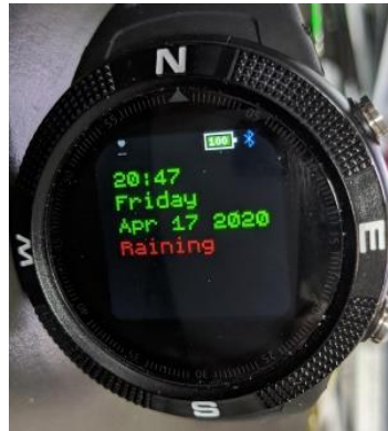
Figure 2 BangleJS platform

I had long viewed networks as simply a means and not important in and of themselves. I was first online in 1966 as part of my job – helping to build an online service for financial analysts. As with networks I view programming as a means of creating an experience. (OK, I also see it as fun, but I don't forget the larger context). Taking the terminal home that summer meant I could explore computing rather than just focus on assigned projects.