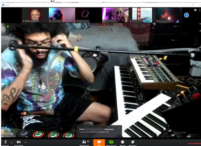
Figure 3 Zoom Concert

By taking a user-centric view and creating a simple experience we now take Zooming vi for granted. Let's heed this lesson and move on rather than be limited by network-centric thinking.