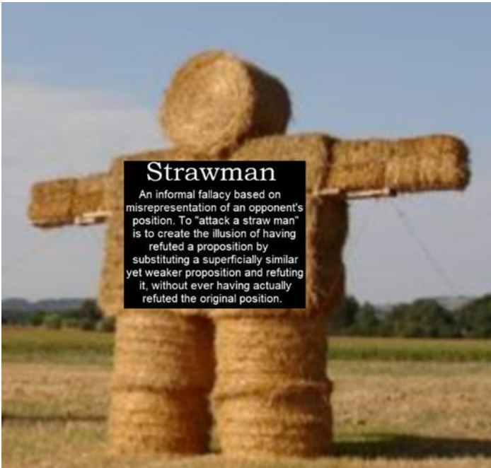
Figure 3Stawman -- will use it to respond on FB